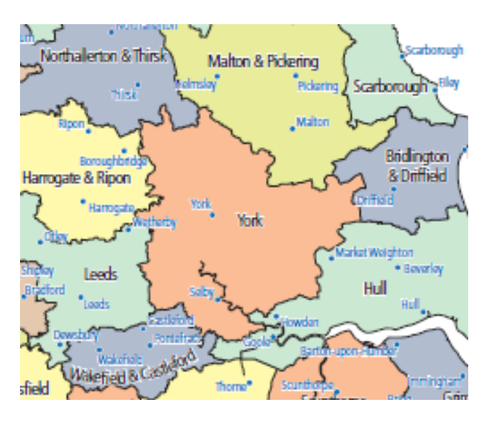
Figure 1: York travel to work area